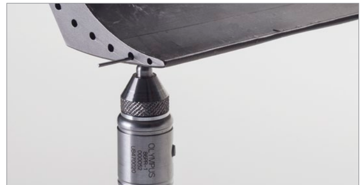
Measurement of a turbine blade using the wire targets