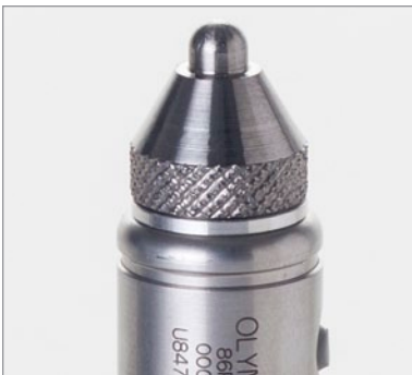
Removable Standard Wear Cap