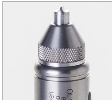
Removable Chisel Tip Wear Cap