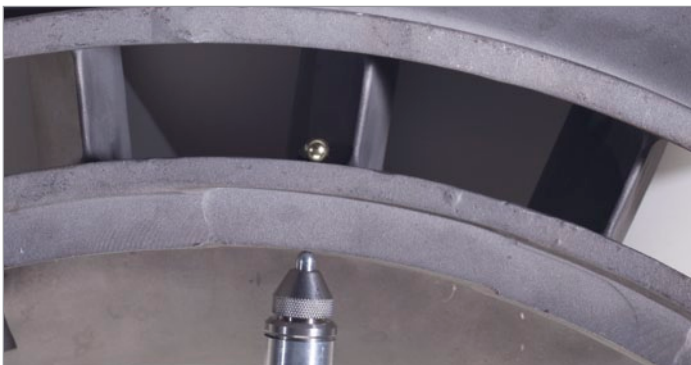
Measurement of a 24.1 mm (0.950 in.) aerospace casting

The Magna-Mike has been successfully integrated into quality control programs to measure aerospace parts made of composites and nonferrous materials. The wire targets can be inserted into cooling holes in turbine blades and the larger magnetic target balls can be used to measure jet engine parts up to 25.4 mm (1.00 in.) thick.